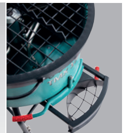
· Vibrating mechanics ·