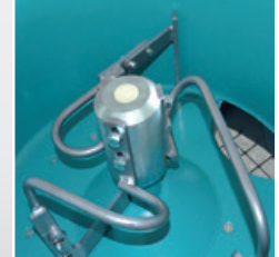
· Mixing tool ·